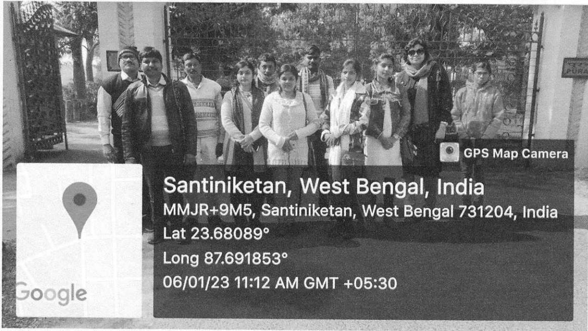
Field of study on the work of Rabindra Nath Tagore at Shantiniketan. ( Jan 06,2023)